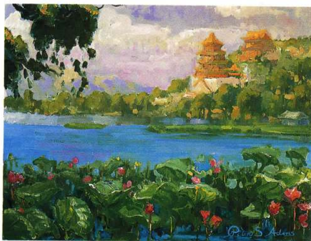
"Summer Palace," Beijing, oil, 14" x 18"

At left, "Tigers Nest," Bhutan, tempera, 13" x 16"