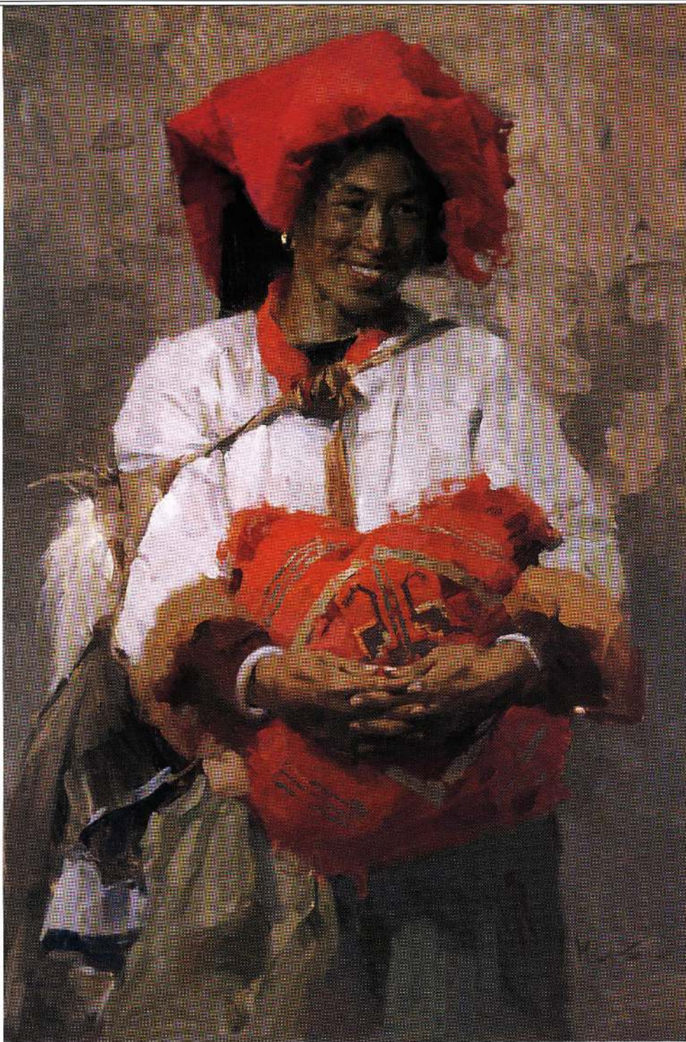
A JOYFUL MOMENT OIL, 30 x 20 IN.