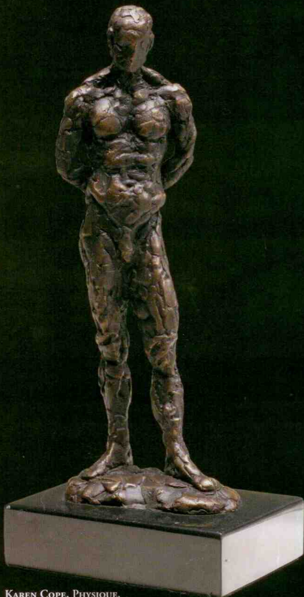
KAREN COPE, PHYSIQUE, BRONZE, 12 X 3 X 2"

mold making, plaster work, bronze casting and metal fabricating."