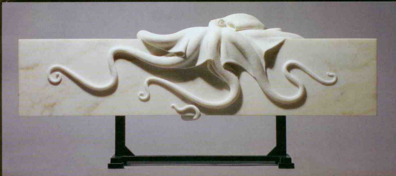
BÉLA BÁSCI, OCTOPUS, ITALIAN MARBLE, 15 X 35 X 5"