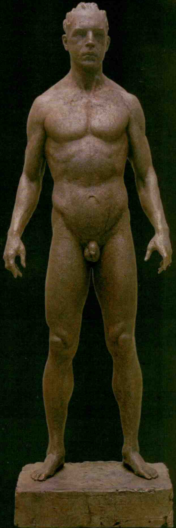
SABIN HOWARD, MAN, BRONZE, 20 X 7 X 4"

"I employ techniques that I learned 30 years ago in the finest marble studios in Italy," says Básci. "Most of those carvers are now gone and there are very few carvers today, even in Italy, who know the secrets that they taught me. My virtuosity is a product of knowing every aspect of the sculptor's trade, including clay modeling,