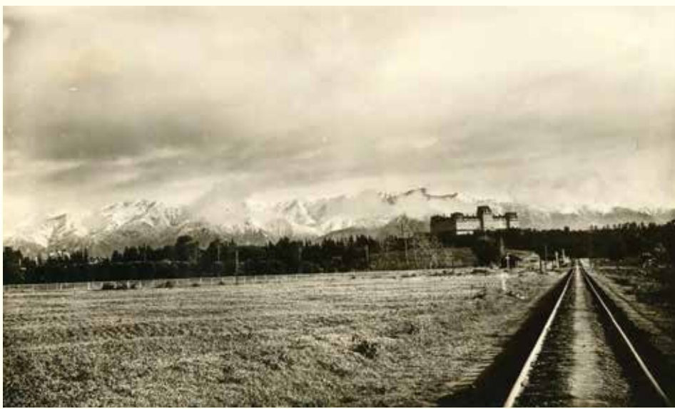
The Raymond Hotel dominated the South Pasadena landscape, c. 1894