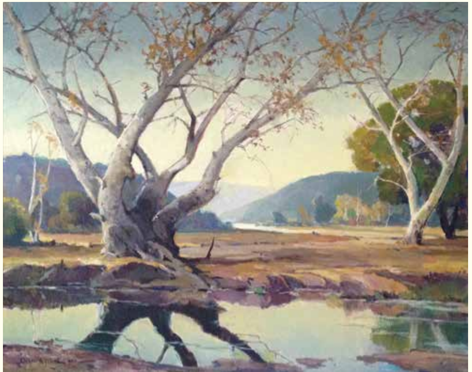
Orrin White (1883–1969) Arroyo Seco, Pasadena, c. 1922 Oil on canvas 25" × 30" Gift of Watkins Family Collection of La Casita del Arroyo, Pasadena