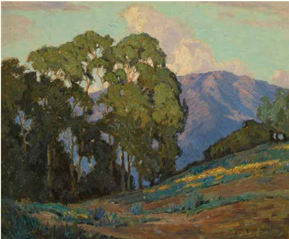
Carl Oscar Borg (1879–1947) Evening Glory; San Gabriel Oil on canvas 20" × 24" Private Collection

An impressive list of other artists of note also found lucrative work thanks to the railroads. In 1916 Edgar Payne (1833–1947)