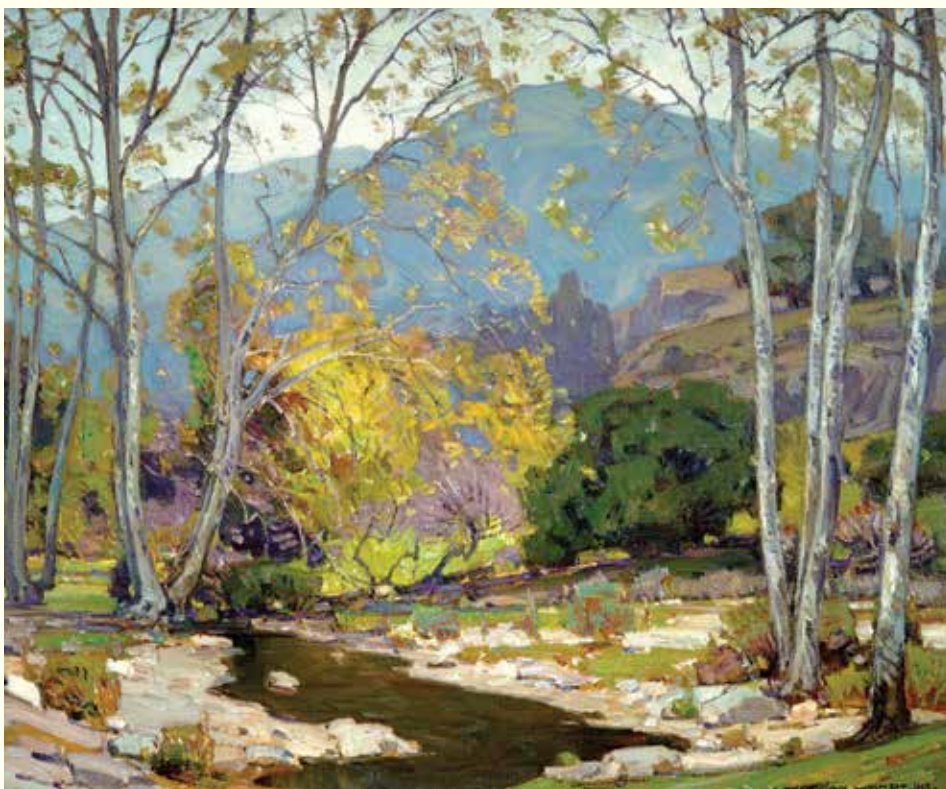
William Wendt (1865–1946)