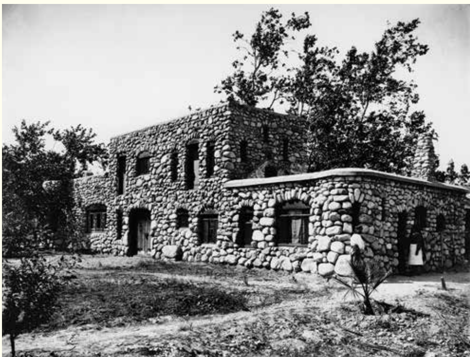
Exterior view of "El Alisal," the home of Charles F. Lummis, c. 1898–1910