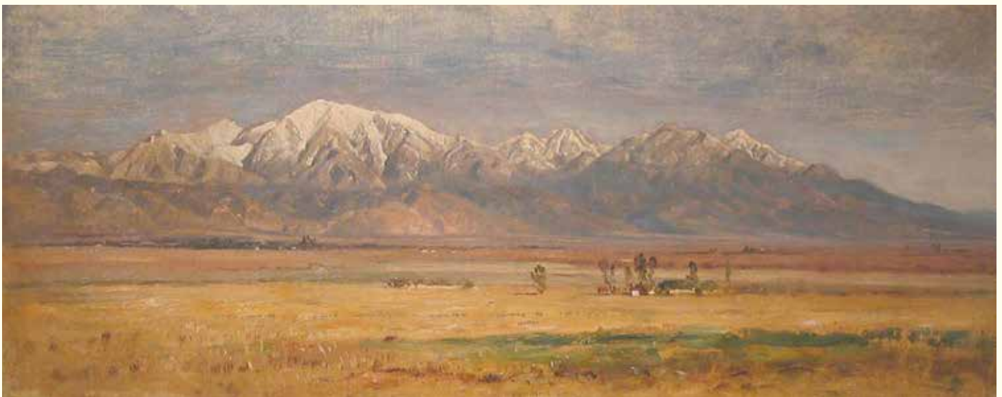
Samuel Colman (1832–1920)

A civic centre was beginning to develop, and founding members of the Indiana Colony began recognizing the potential for higher profits in selling their land to developers, rather than in