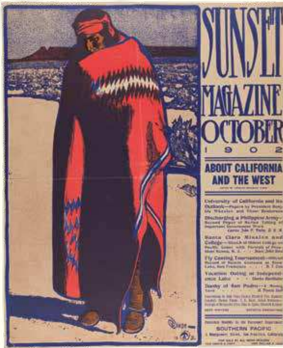
Maynard Dixon (1875–1946) Sunset Magazine, October 1902 Published by Southern Pacific Company Lithograph 23" × 19" Purchase, Leonard A. Lauder Gift, 2015