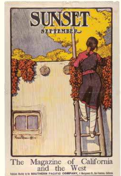
Maynard Dixon (1875–1946) Sunset Magazine , September 1904 Published by Southern Pacific Company Lithograph 26" × 17" Purchase, Leonard A. Lauder Gift, 2015 Collection of Metropolitan Museum of Art