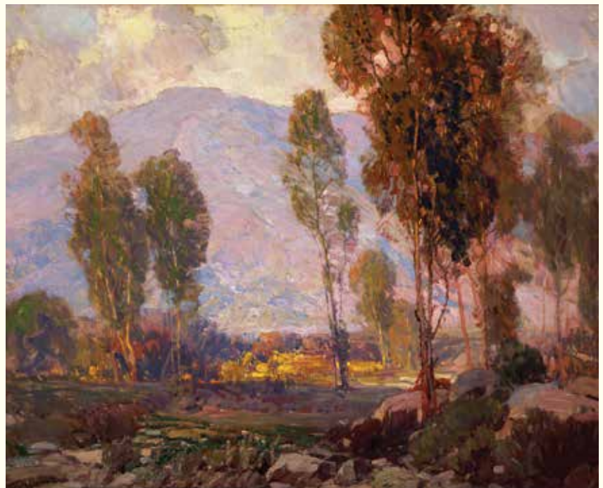
Hanson Puthuff (1875–1972) Verdugo Canyon Oil on canvas 32" × 40" The Irvine Museum Collection at the University of California, Irvine

hotels were built: Hotel Green (opened 1894), La Vista del Arroyo Hotel (opened 1882), The Maryland (opened 1903), and the Hotel Wentworth (opened 1907), which later reopened as The Huntington Hotel in 1914 after it was purchased by the railroad tycoon Henry E. Huntington . Many arrived as tourists and several returned later as new residents.