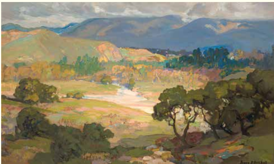
Franz A. Bischoff (1864–1929)