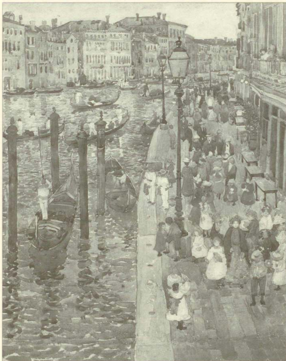
Maurice Brazil Prendergast (1858–1924) The Grand Canal, Venice , 1898–99 Watercolour and pencil on paper 18 1/8" × 14 1/4" Collection: Daniel J. Terra

est lovers. Perhaps it is in the legend and myth of this romantic spirit that nineteenth-century American artists became captivated by the many alluring charms of Venice.