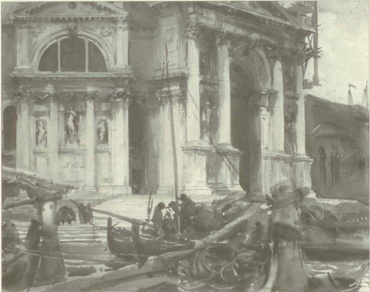
John Singer Sargent (1856–1925) Collection: Brooklyn Museum of Art

Venice, Italy captures one's imagination. Often veiled in a cool, grey fog, the city provokes a sense of mystery. But, it is when the sun pours onto the canals that Venice is at its best — when the waterways sparkle and the buildings appear to dance.