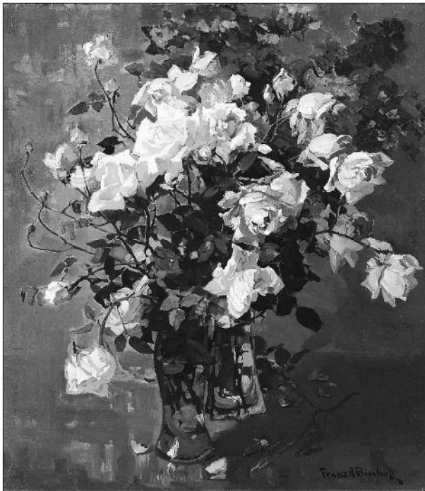
Franz Bischoff (1864-1929) White and Pink Maman Cochet-Roses Oil on canvas 34" × 30" Private collection