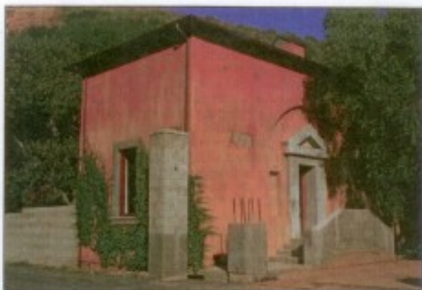
The Pinkham residence today.