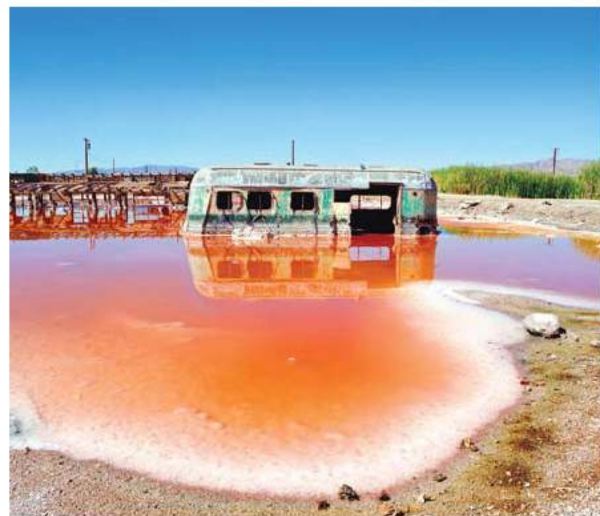
Kim Stringfellow, Abandoned Trailer, Bombay Beach, CA , 2000, LightJet digital C-print, 38x30.5 inches, edition of 10