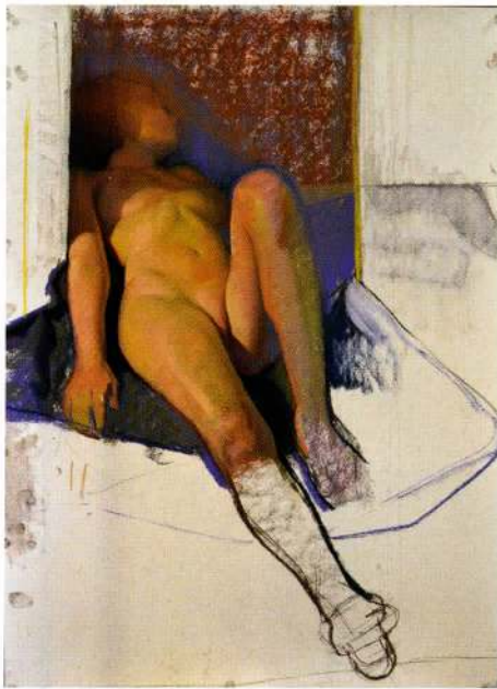
EMIL JOSEPH ROBINSON, WOMAN 1, PASTEL ON PAPER, 30 X 22"