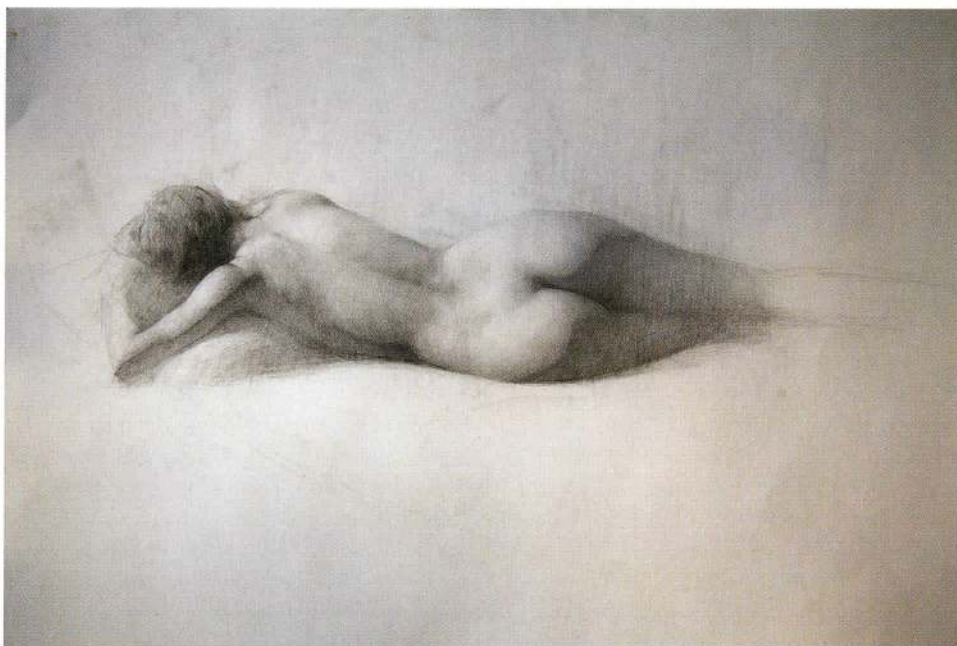
JEREMY LIPKING, RECLINING FIGURE, GRAPHITE ON PAPER, 18 X 24"