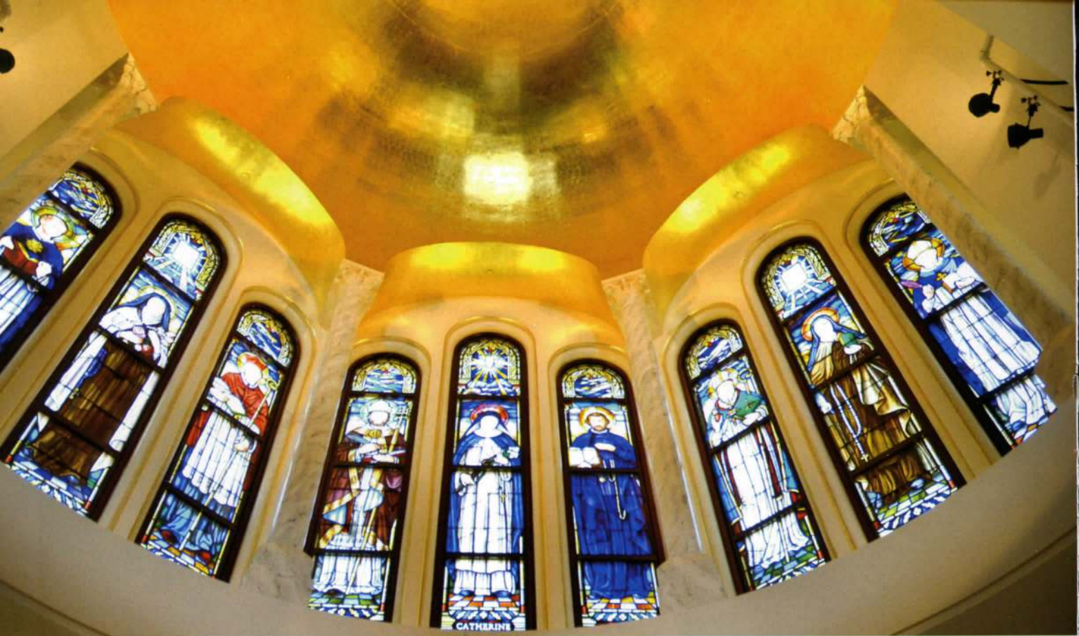
Above the tabernacle is the gold-leaf dome with nine of the 33 doctors of the church in stained glass by Judson Studios of Los Angeles.