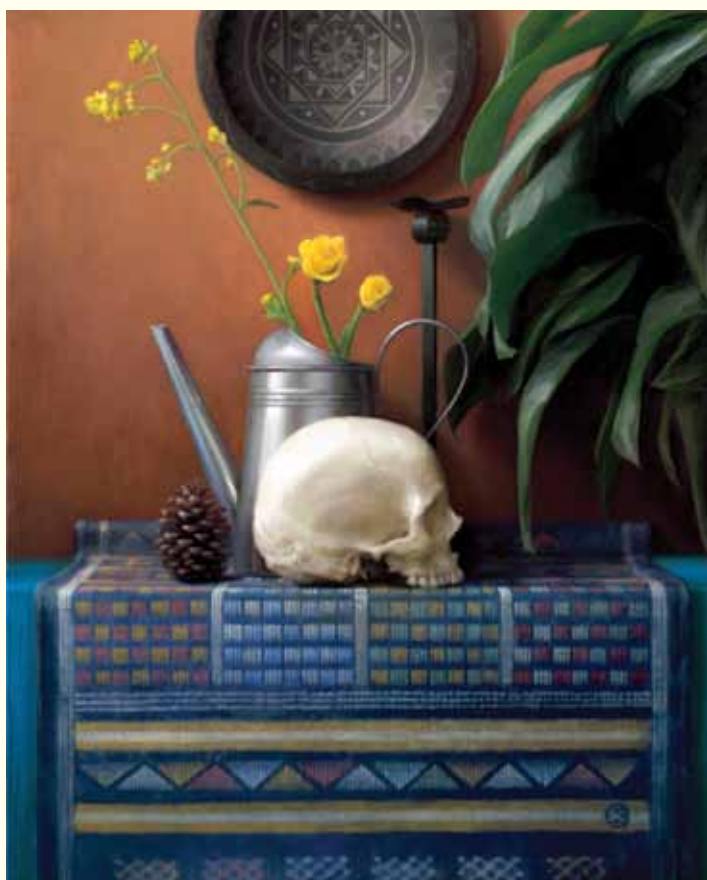
A Place in the Sun Oil on panel 25" × 20" Courtesy of the California Art Club in association with the Autry Museum of the American West