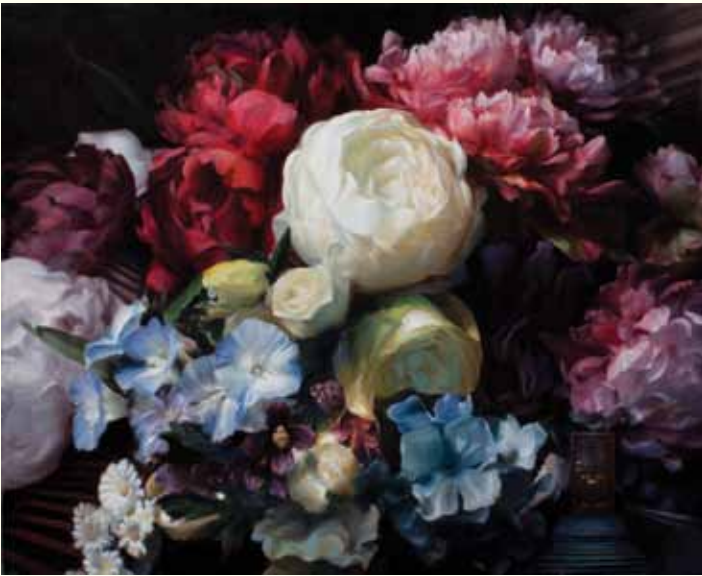
Stairs and Flowers Oil on panel 16" × 20" Private collection

brushy quality of working a la prima is so expressive, but I also enjoy being technically precise."