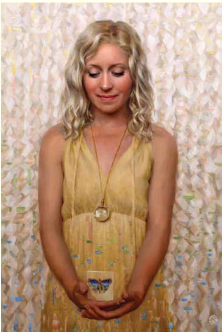
I'd Love to See You Before I Go