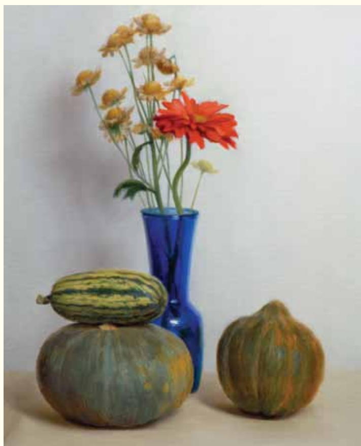
Squash Oil on panel 16" × 20"