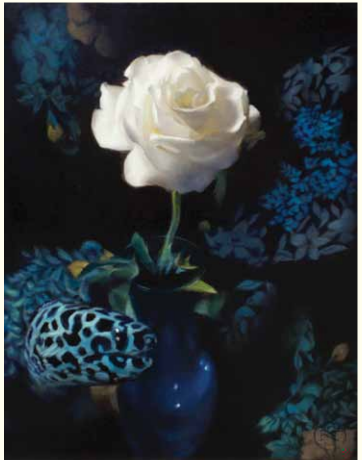
Strange Catch Oil on panel 12" × 9"