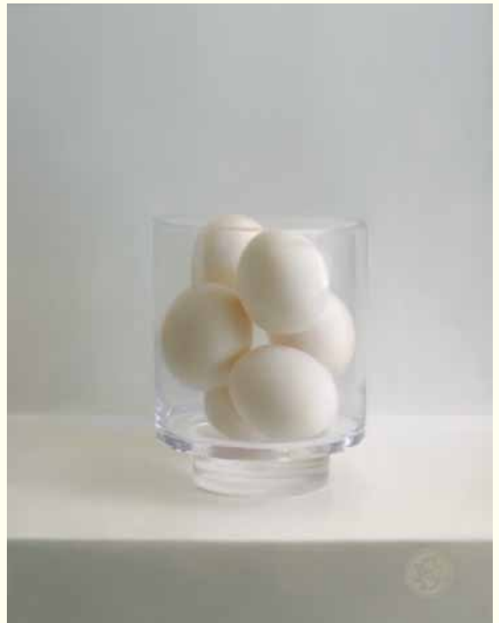
Eggs Oil on panel 10" × 8" Private Collection