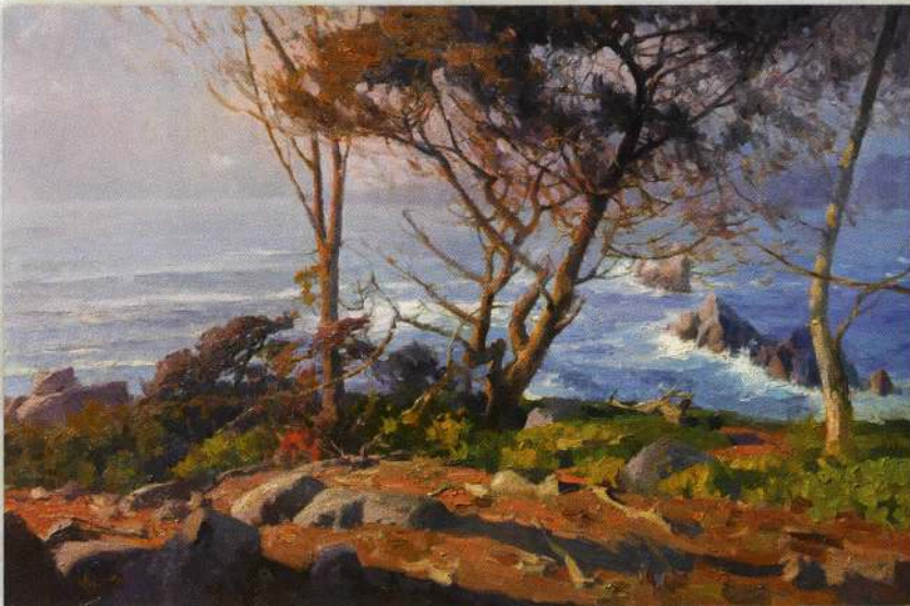
Mian Situ, Pacific Breeze , oil, 24 x 36.