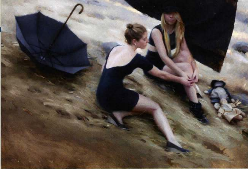
Joseph Todorovitch, Outing , oil, 35 x 48.