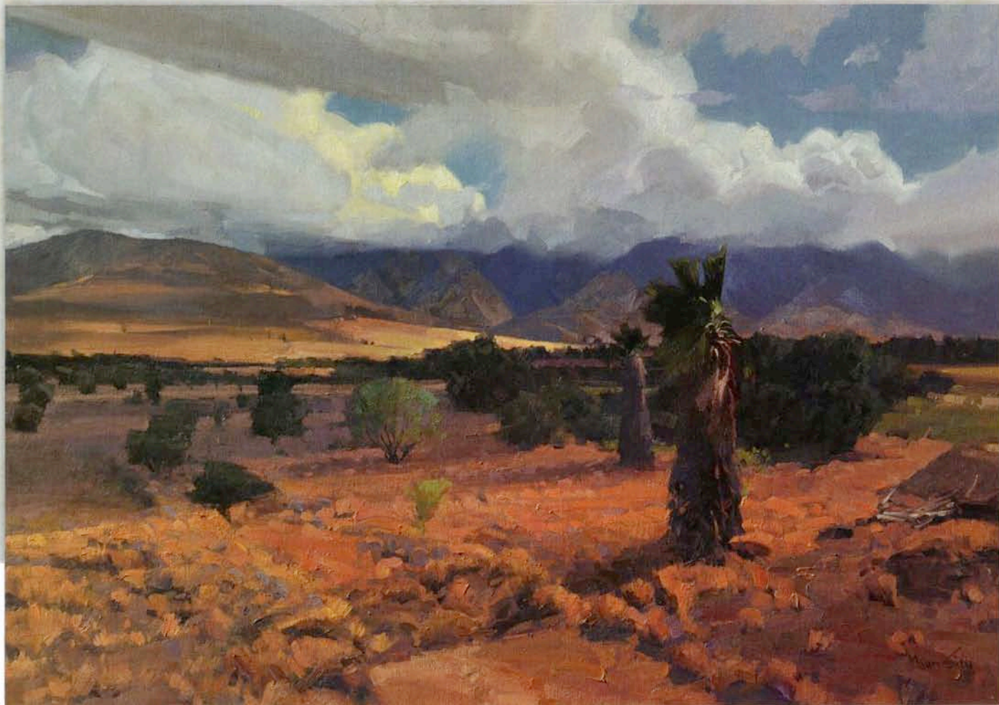
Mian Situ, Hawaii Cloud, oil, 20 x 28.