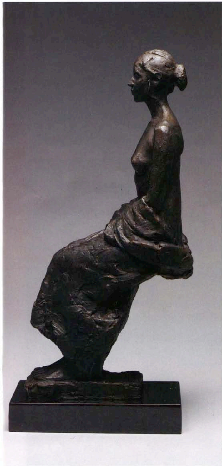
George Carlson, At the Gate of Dawn , bronze, 24 x 8 x 17.