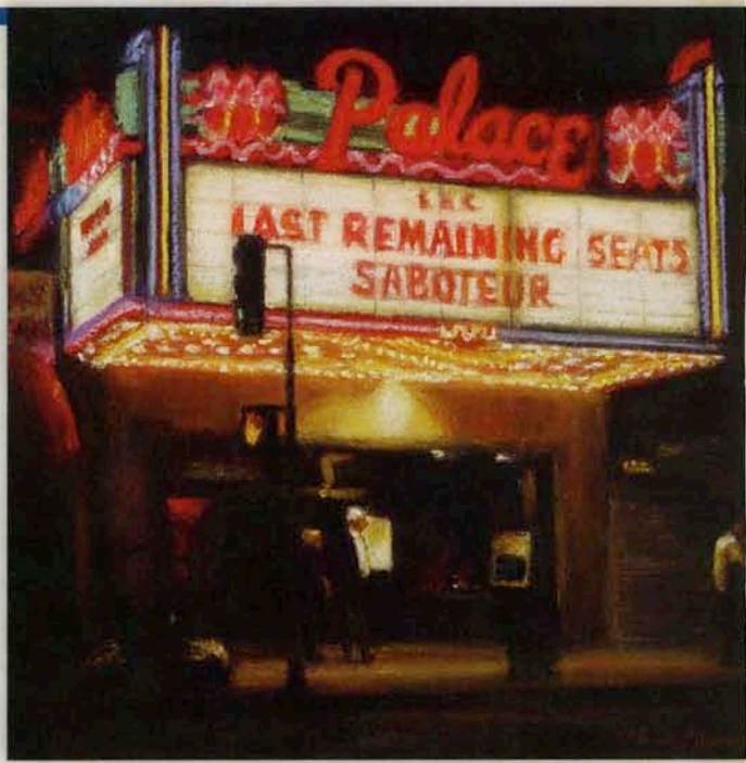
Nancy Popenoe, Palace Theater, pastel, 10 x 10.