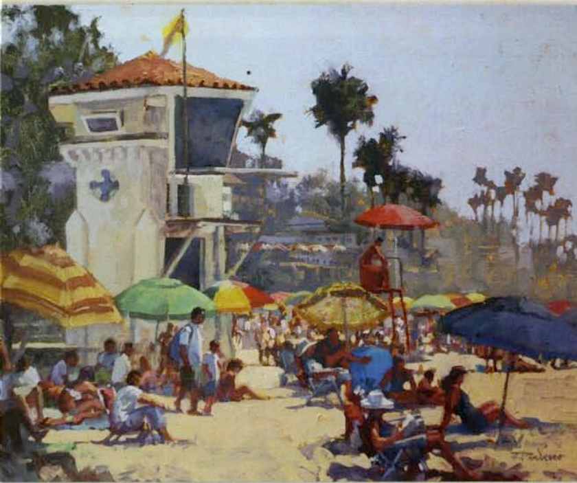
Rita Pacheco, Main Beach Summer, oil, 16 x 20.