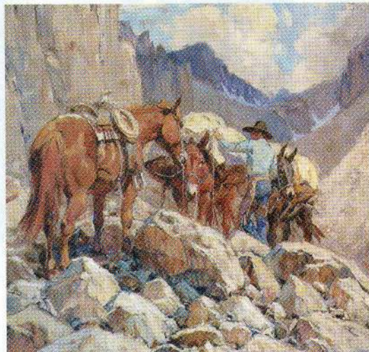
Adjustments— Taboose Canyon , 30 by 30-inch acrylic.