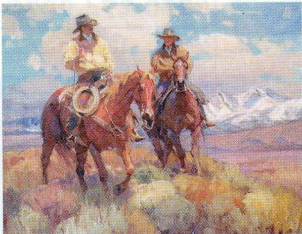
First Snow , 24 by 28-inch acrylic.

“We were living in a little farmhouse, and I