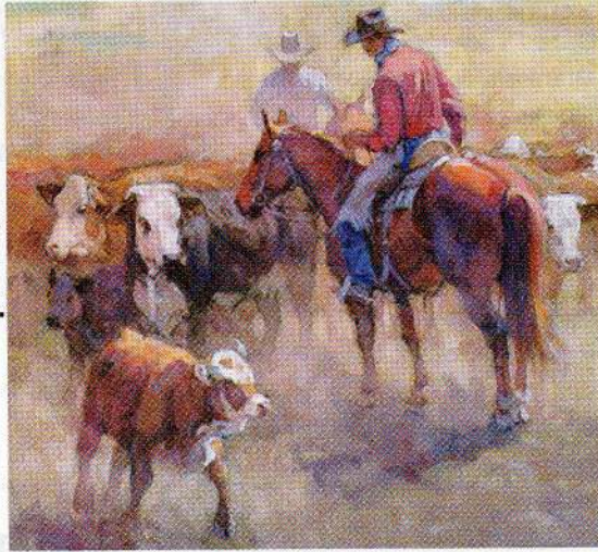
Buckaroo in Red , 26 by 28-inch acrylic.