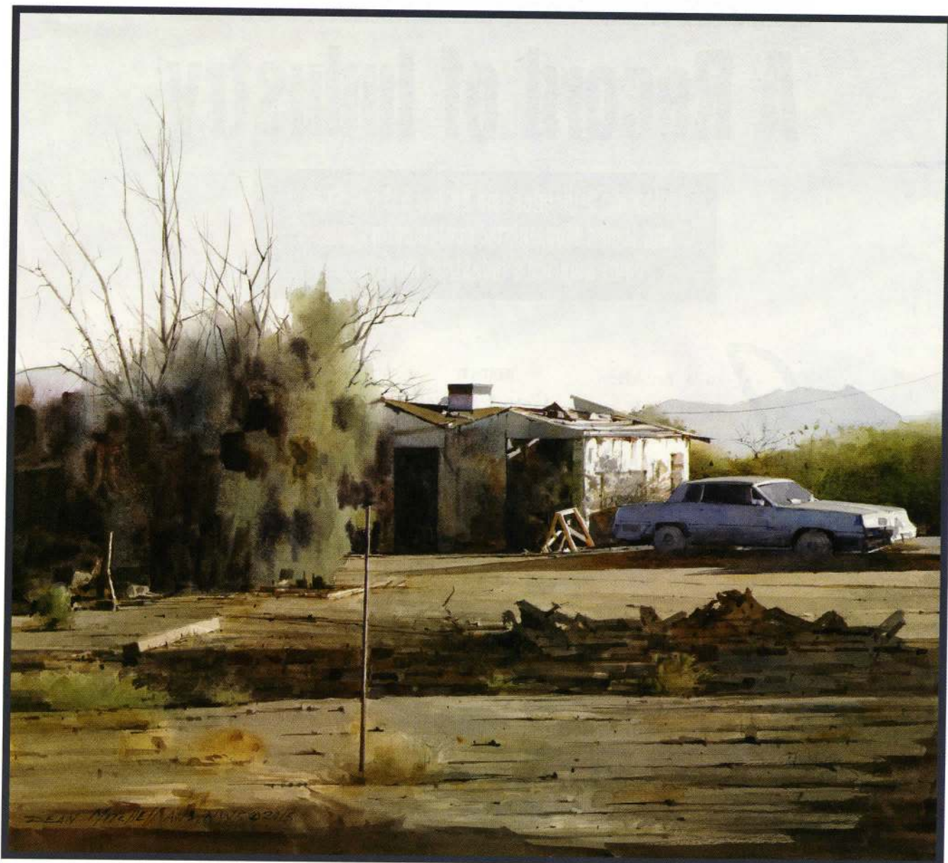
Dean Mitchell, Rotting in the Light Watercolor | 18 x 19 inches

What is there to say about industry today that hasn't been splashed across the news, captured in-depth by photographers around the world, blogged about, and debated on the floor of Congress? In other words, why bother?