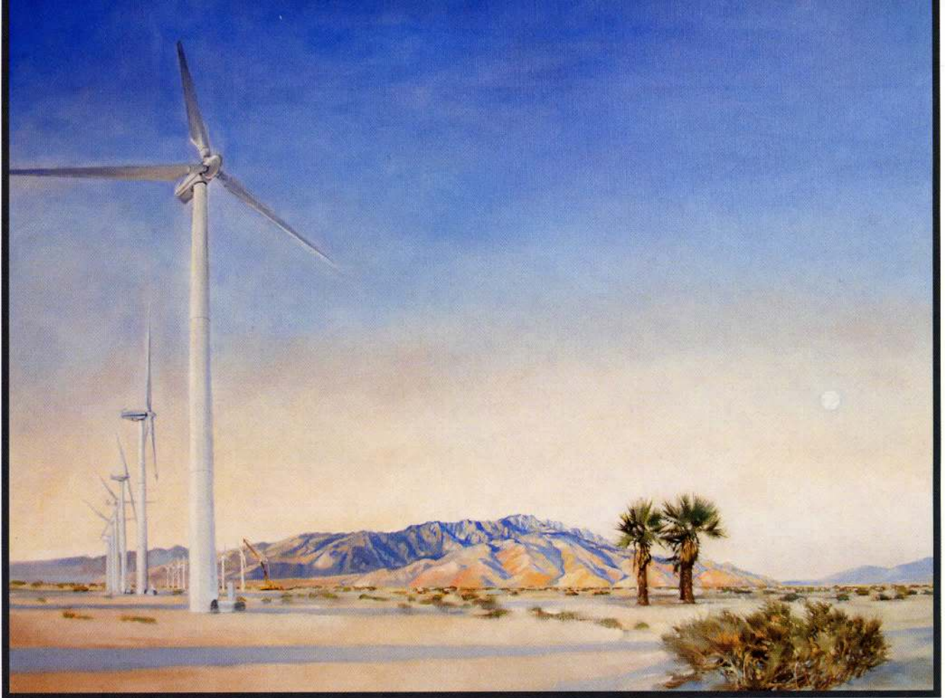
Don Stinson, Giorgione Pass: Imagined Beginnings Oil on Linen | 36 x 46 inches