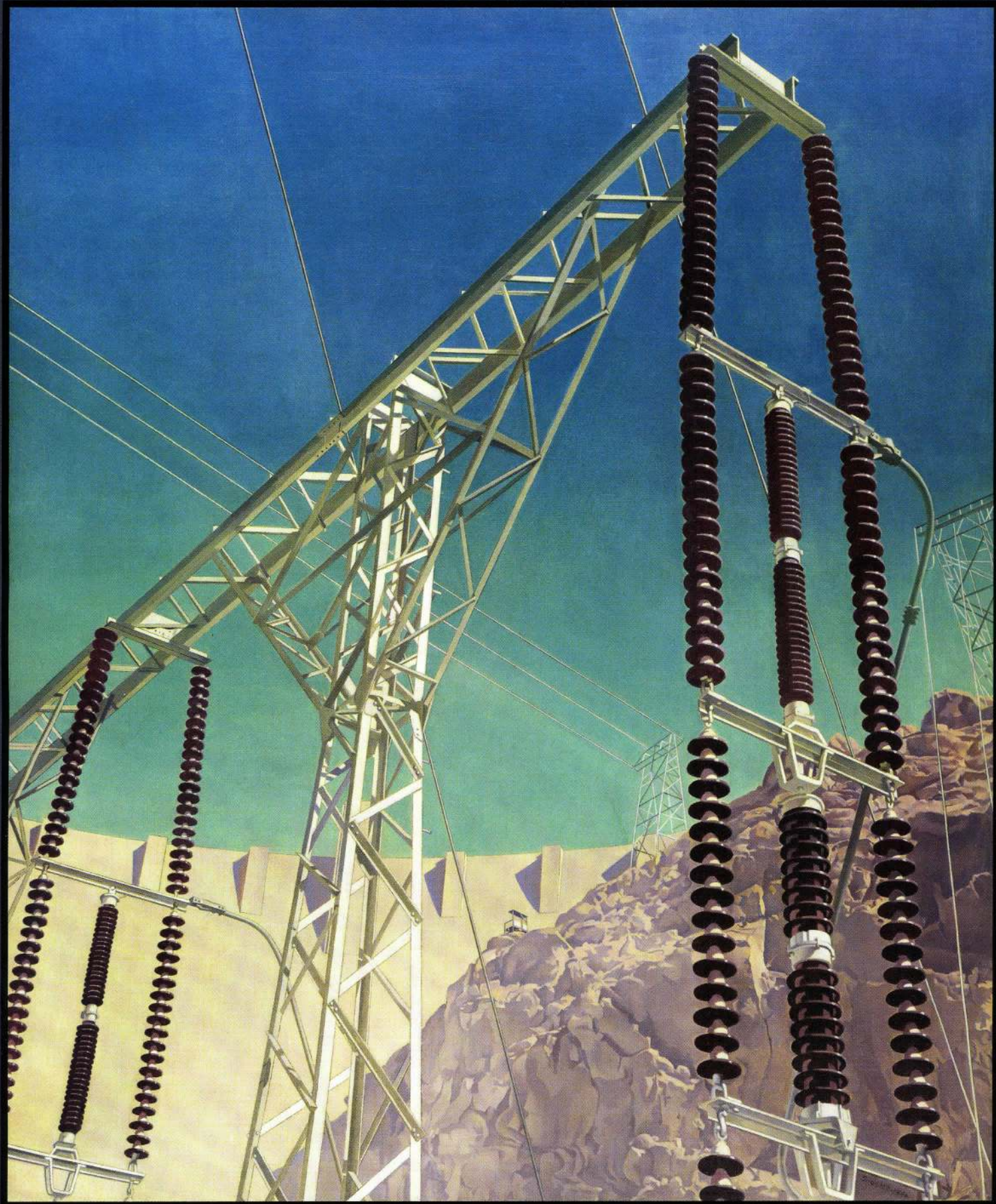
Charles R. Sheeler, Jr. [1883–1965] Conversation – Sky and Earth Oil on Canvas | 1940 Amon Carter Museum, Fort Worth, Texas; 2009.7