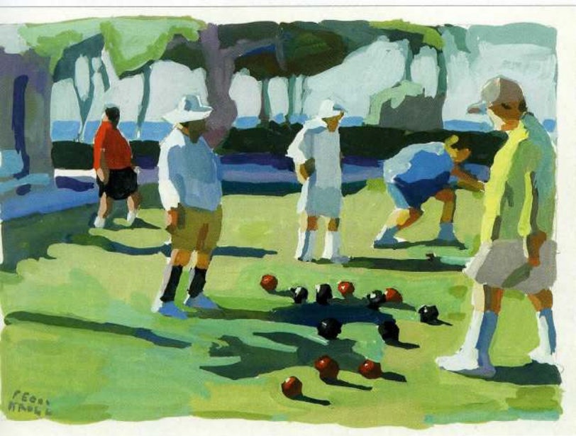
Peggi Kroll-Roberts, Laguna Lawn Bowling , gouache, 8 x 11.