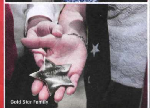
Gold Star Family