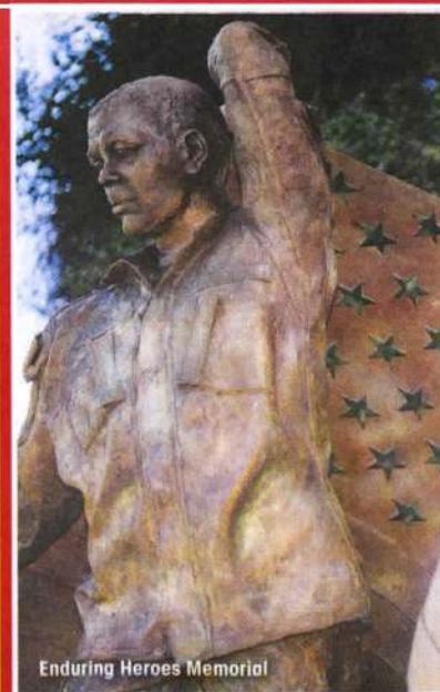
Enduring Heroes Memorial