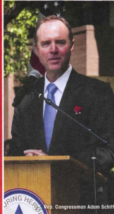
Rep. Congressman Adam Schiff