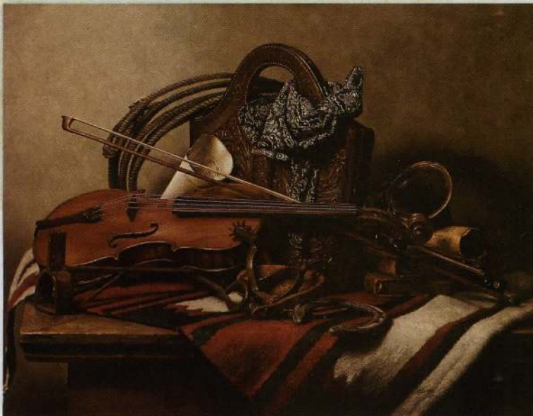
Yun Wei, A Cowgirl's Table, oil, 24 x 30.