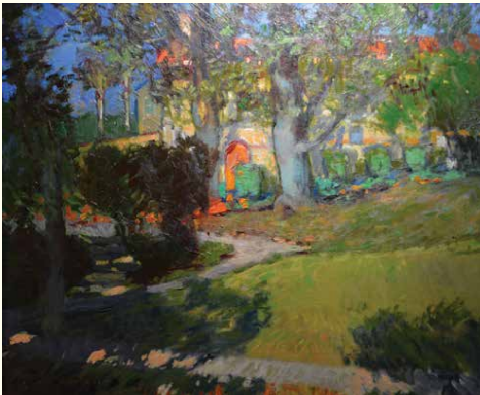
Manaratha Reach Oil 20" × 24"