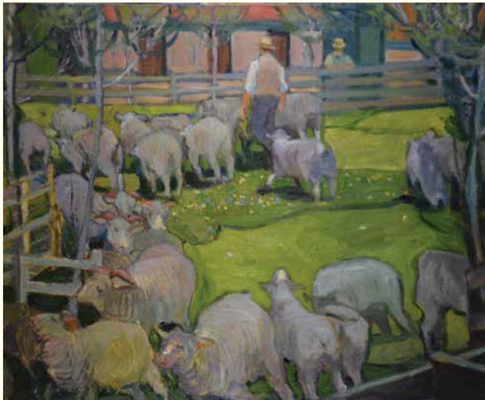
The Culling Oil on canvas 20" × 24"