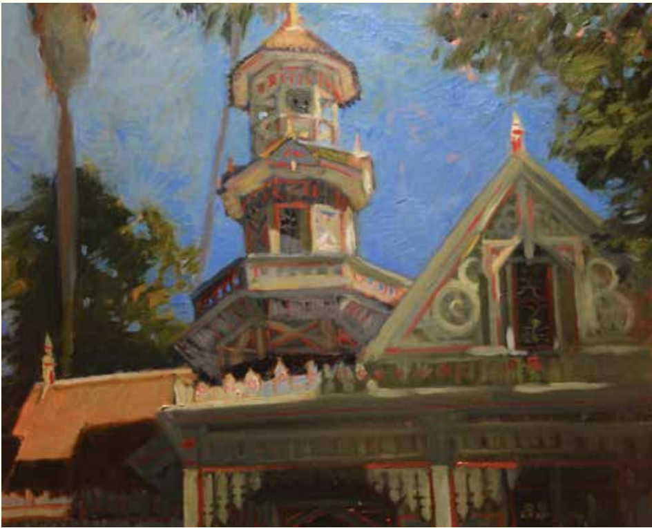
Mrs. Brown's Cottage