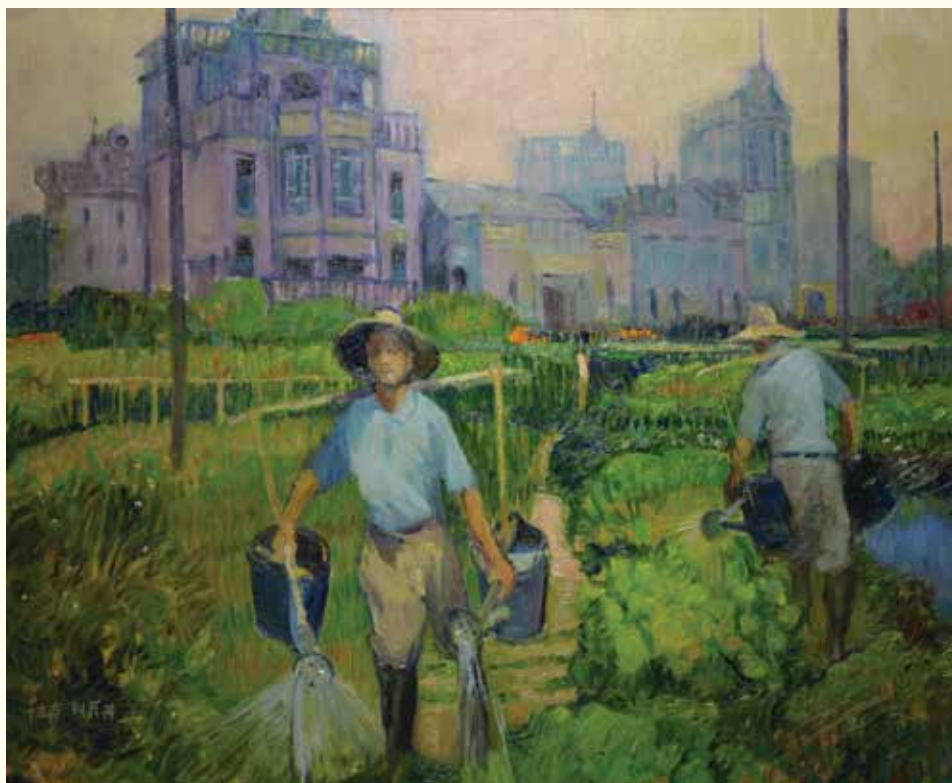
They That Tend Oil on canvas panel 20" × 24"