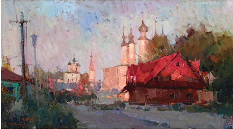
Jove Wang, "Suzdal, Russia," Oil on canvas, 18" x 32"

American Legacy Fine Arts (Pasadena, CA) recently announced its "Fleeting Moments 2nd Biennale: Works en Plein Air," a group exhibition that takes an extraordinary look at the contemporary painting movement. With more than 40 new works created by 24 artists, the exhibition focuses on continuing the evolution and growing appreciation of painting outdoors to capture the ephemeral qualities of natural light.