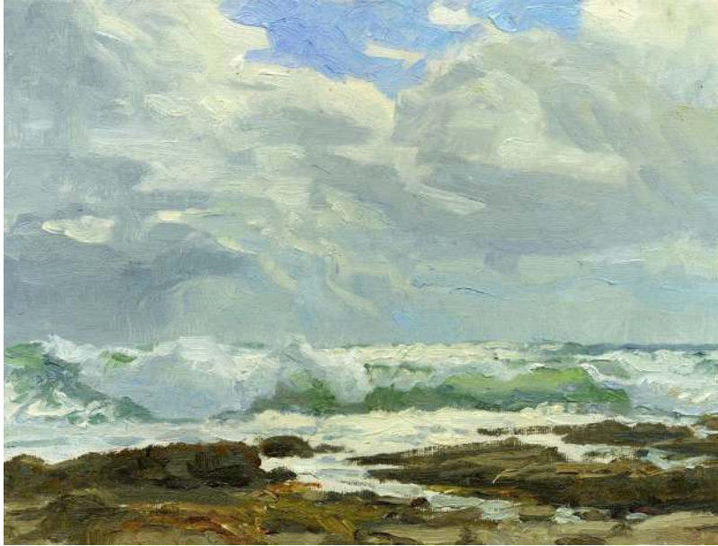
Stephen Mirich, "Storm Break, San Pedro," Oil on canvas, 9" x 12"

elements of light and its momentary effects; the relationship of juxtaposed colors; and brushwork that is loose, lively, broad, or impasto. Smaller works may be completed in their entirety out-of-doors, while large-scale plein air paintings may be done in the studio with the use of on-location studies and color notes taken in nature.