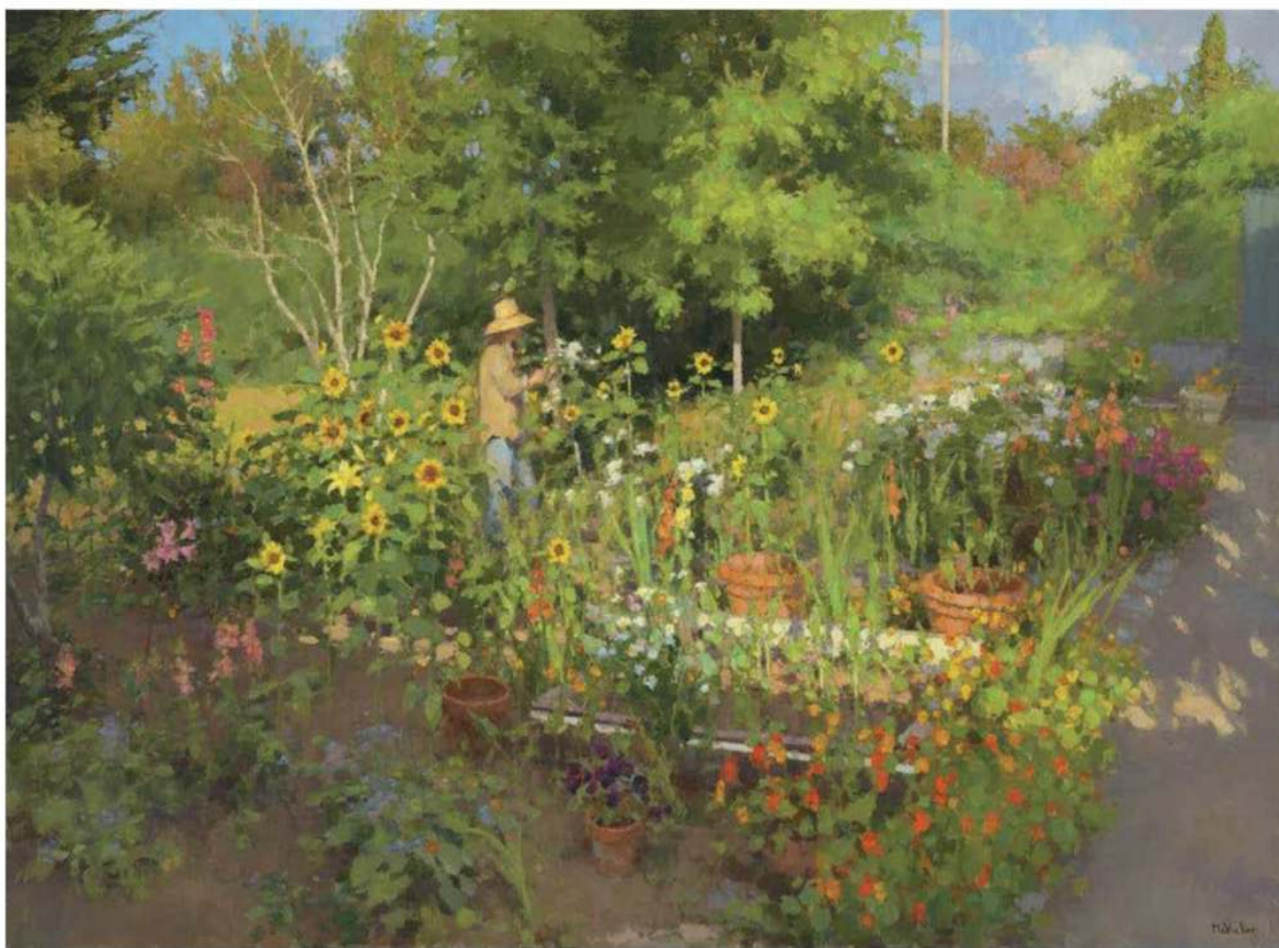
Summer Garden 2013, oil on linen, 36 x 54 in. Collection the artist Plein air

but the process of transferring that mental image to a canvas is never quite as fluid as I think it should be. Having a general conception is one thing, but it is hard work to fully realize it in terms of color choices, value relationships, and overall harmonies. I just have to keep solving problems and reconsidering the progress of the work until the image comes together.”