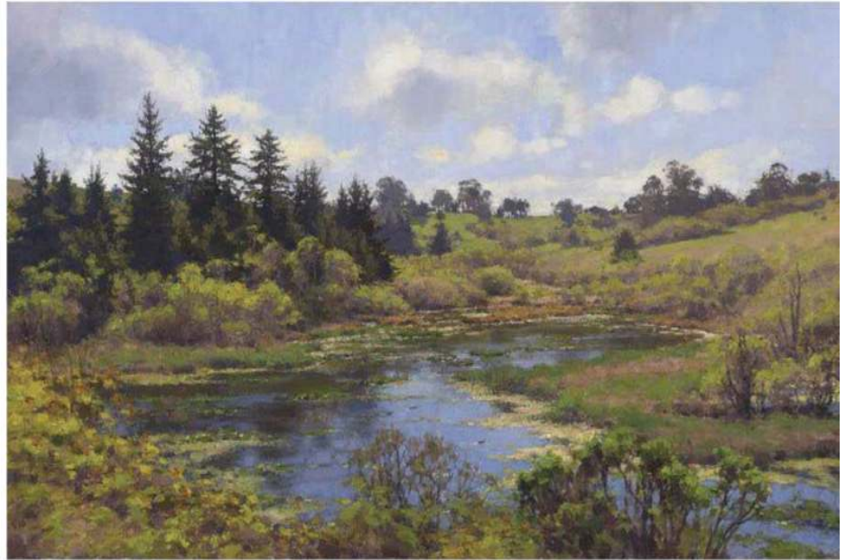
Spring Pond 2013, oil on linen, 24 x 40 in. Collection the artist Plein air

He continues, "A large plein air painting like North Coast, Morning Light might take a couple of years to actually complete because it depends on painting under very specific atmospheric conditions, when there wasn't any fog and the skies were clear. I develop that particular painting in two weeks of work over two summers, when the morning fog was similar to what initially motivated me. I needed the early-morning sun piercing through the dense atmosphere. With that particular painting, I mounted the canvas to a mid-sized studio easel rather than my precarious French easel."