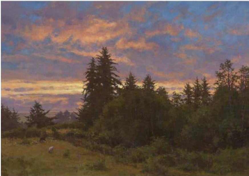
June Twilight 2012, oil on linen, 30 x 48 in. Collection the artist Plein air and studio