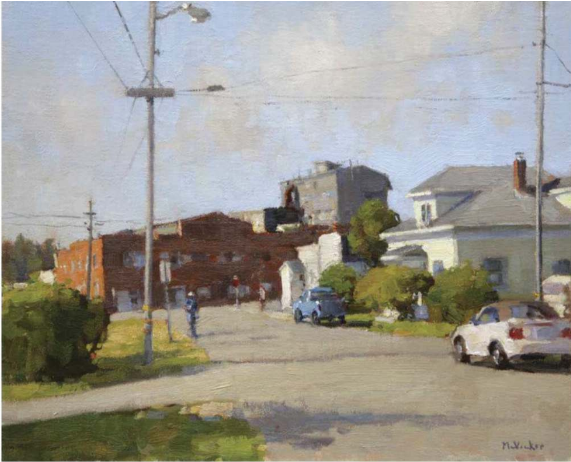
Loleta Street 2014, oil on linen, 12 x 16 in. Collection the artist Plein air