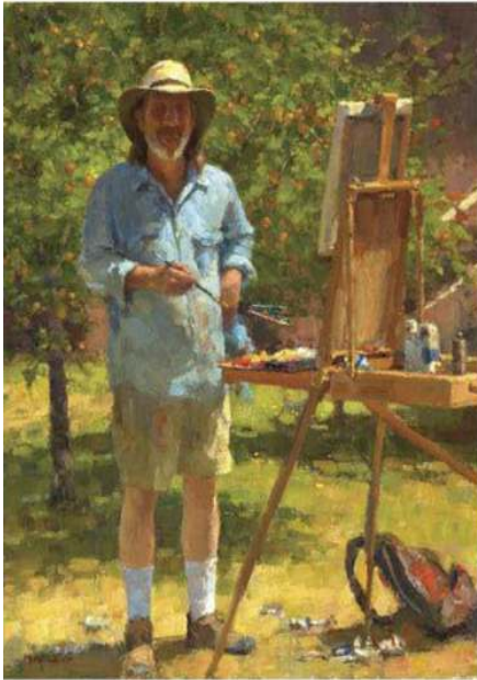
Plein Air Self-Portrait 2013, oil on linen, 18 x 14 in. Collection of the artist Plein air