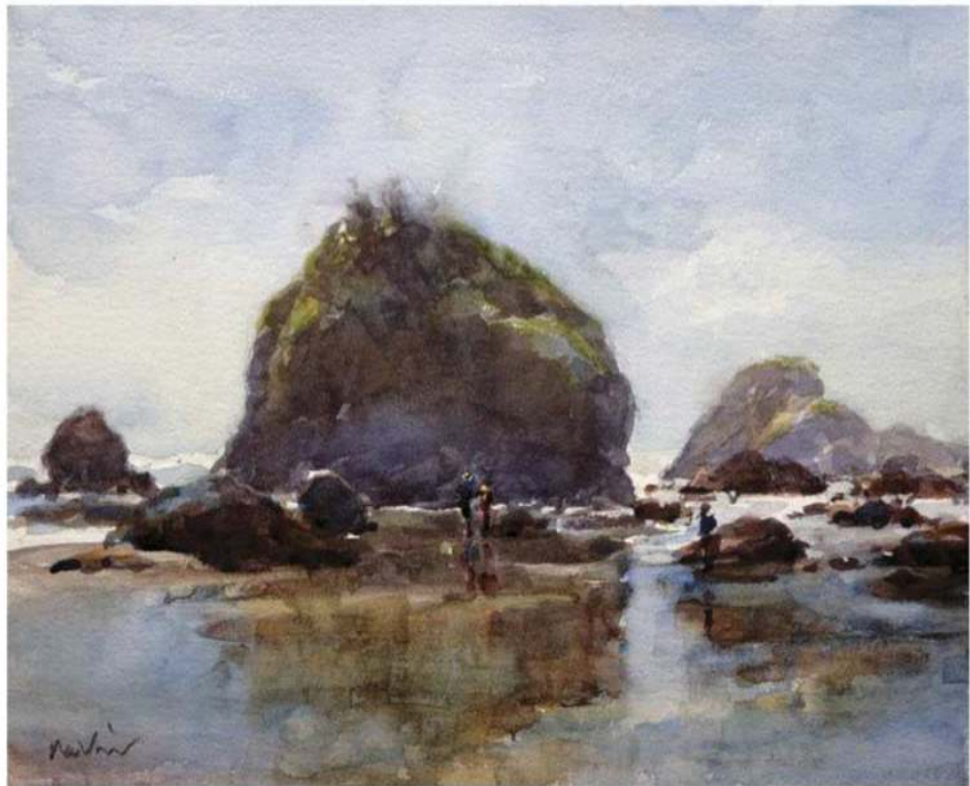
Low Tide, Houda Beach 2014, watercolor, 10 x 14 in. Private Collection Plein air