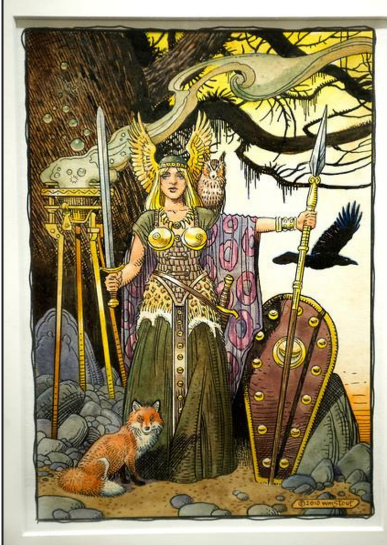
William Stout ink and watercolor drawing, "Brunhilde" (From Wagner's Ring Cycle) at American Legacy Fine Arts. Stout is a famously diverse artist of international renown in many fields: themed entertainment and motion picture design (specializing in science ...