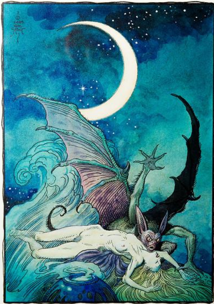
William Stout ink and watercolor drawing "Vampyr", at American Legacy Fine Arts Monday, July 8, 2013. Stout is a famously diverse artist of international renown in many fields: themed entertainment and motion picture design (specializing in science fiction/fantasy/horror films), ...