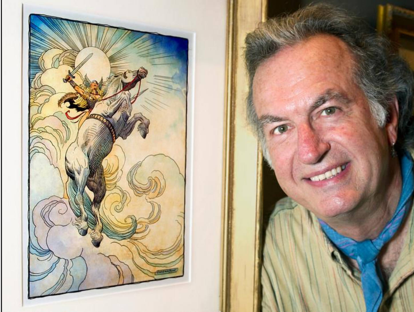
William Stout with ink and watercolor drawing "Valfyrie's Battle Song" at American Legacy Fine Arts Monday, July 8, 2013. Stout is a famously diverse artist of international renown in many fields: themed entertainment and motion picture design (specializing in science ...