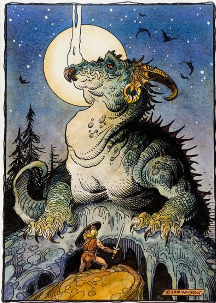
William Stout ink and watercolor drawing "Siegfried and Fafnir" at American Legacy Fine Arts Monday, July 8, 2013. Stout is a famously diverse artist of international renown in many fields: themed entertainment and motion picture design (specializing in science ...