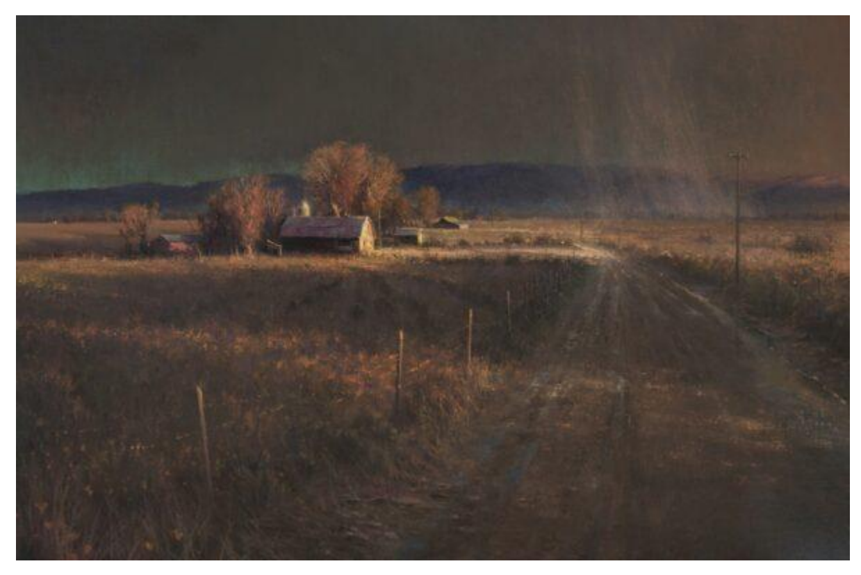
"Promise of a Rainbow," 2019, by American painter D. Eleinne Basa. Oil on linen; 24 inches by 36 inches. Recipient of The Artist's Library Award at the "15th International ARC Salon Exhibition (2020–2021)."

In the landscape painting "Promise of a Rainbow," American painter D. Eleinne Basa has also depicted a fleeting moment: "The time before you see the emergence of a rainbow," she said, in her online artist statement. Deep brown and purple hues dominate the rich canvas as the land recovers from a recent storm, and the sun is about to emerge again.