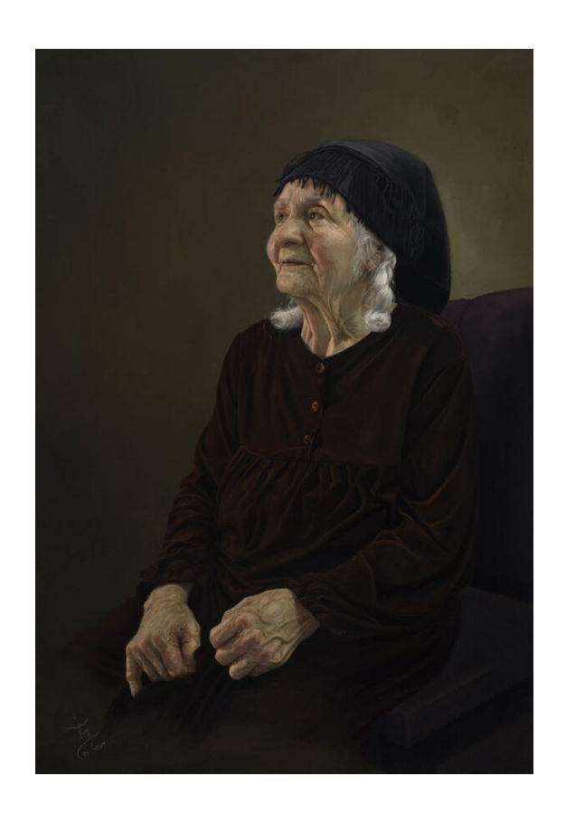
"Daapir," 2017, by Iranian painter Marjan Abedian. Oil on canvas; 29 3/4 inches by 20 1/4 inches. Recipient of the Portraiture Award (second place) at the "15th International ARC Salon Exhibition (2020–2021)."

The themes of the 28 lots vary. Below is a small selection that highlights beauty and our shared humanity.