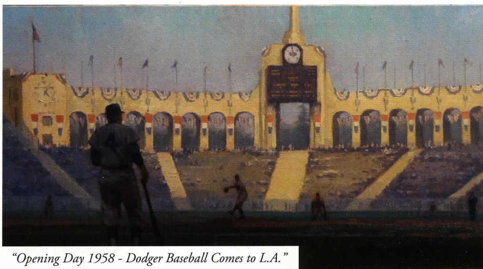
“Opening Day 1958 - Dodger Baseball Comes to L.A.”