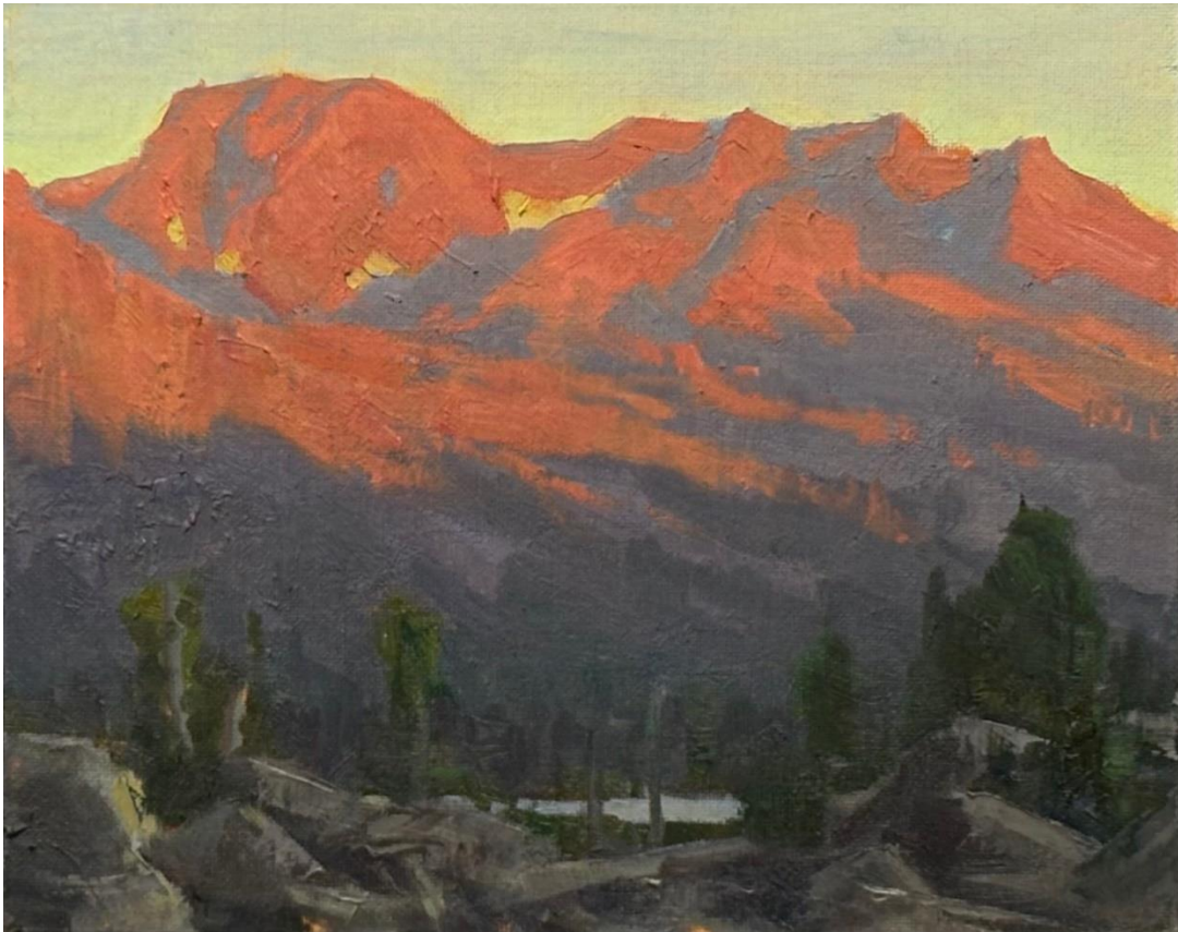
Alpine Glow above Caples Lake , Jean LeGassick, oil on canvas panel, 8" x 10"

“At a time when audiences seek respite from constant digital stimulation, Mastering the Mood invites viewers into a quieter, more contemplative visual experience rooted in atmosphere, light, and emotional nuance.”