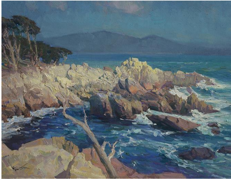
Mian Situ, "Sunlit Coastline, 17-Mile Drive," 20 x 26 in.

The exhibition will feature paintings that embrace tonal harmony, expressive brushwork, and subtle shifts of illumination—qualities that allow a scene to transcend its geographic setting and become an intimate, personal experience for the viewer. Works range from serene coastal vistas and luminous sunsets to moody interiors, still lifes, and moonlit expanses, offering a rich diversity of emotional narratives.