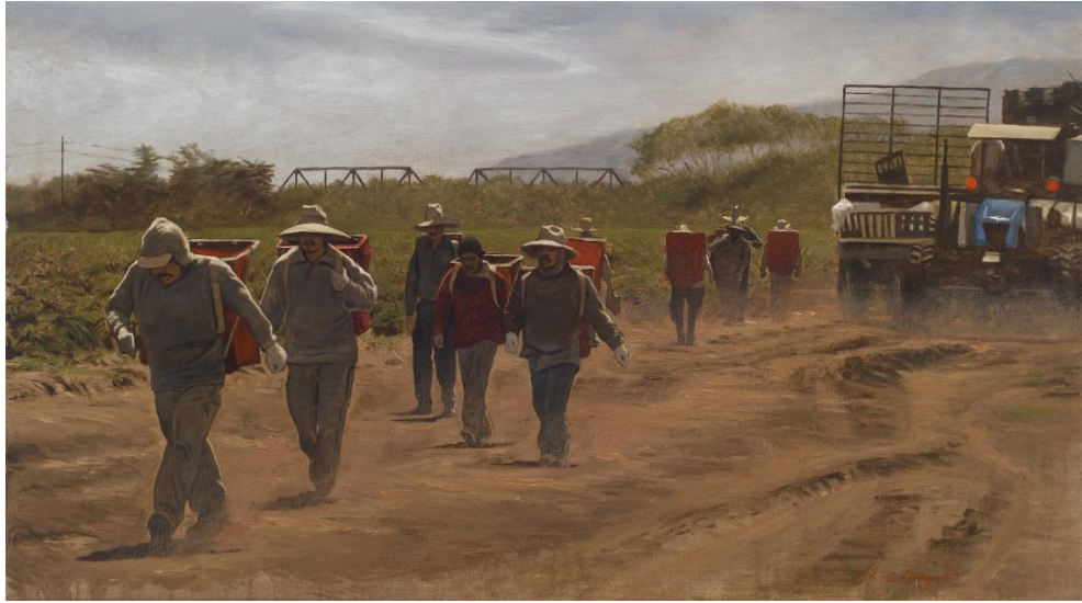
Warren Chang, "Artichoke Haulers," 19 x 34 in.

Mastering the Mood: Atmospheric Emotion brings together a curated selection of works by leading contemporary artists who explore the emotional resonance found in nature's most evocative moments. From the quiet poetry of mist-covered mornings to the dramatic interplay of dusk light and shadow, the exhibition invites viewers to experience artwork not merely as places or things, but as profound emotional states.