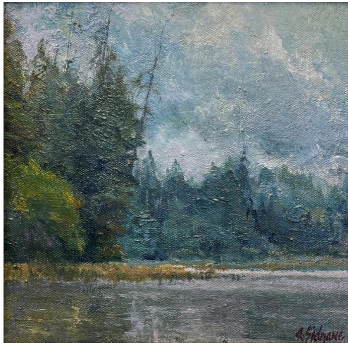
Amy Sidrane, "Mist and Stillness," oil on canvas, 8 x 8 in.

Mastering the Mood: Atmospheric Emotion brings together a curated selection of works by leading contemporary artists who explore the emotional resonance found in nature's most evocative moments. From the quiet poetry of mist-covered mornings to the dramatic interplay of dusk light and shadow, the exhibition invites viewers to experience artwork not merely as places or things, but as profound emotional states.