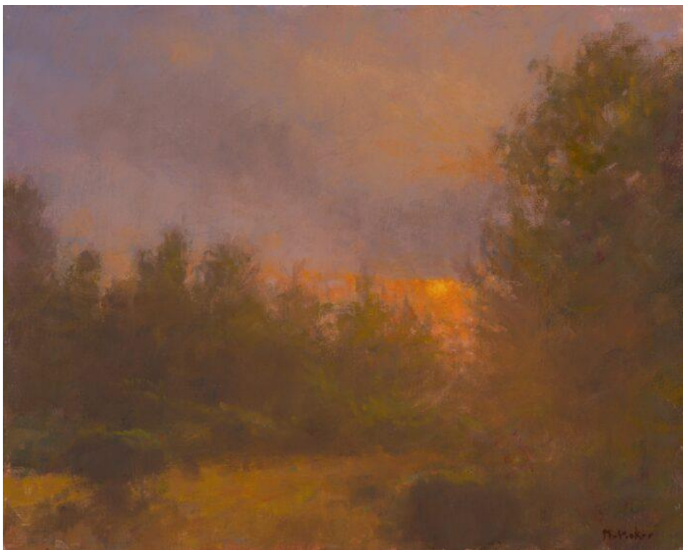
Jim McVicker, "Summer Sunset," 16 x 20 in.

American Legacy Fine Arts (ALFA) , a premier gallery in Pasadena, California, specializing in contemporary-traditional fine art, is pleased to announce Mastering the Mood: Atmospheric Emotion , a compelling exhibition celebrating the expressive power of light, color, and atmosphere in representational painting. The exhibition is on view from April 24 through June 6, 2026, with a special opening reception for collectors and invited guests on Friday, April 24.